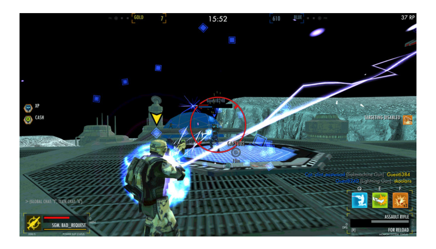
Download ->->-> <a href="http://bit.ly/2SKLvRD">http://bit.ly/2SKLvRD</a>

Warhammer 40,000: Dawn Of War II - Retribution - Tyranid Race Pack Activation Code [addons]